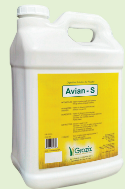
Avian - S